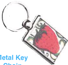
Metal Key Chain

Grandparent's Day Christmas Father's Day Birthdays Hanukkah Mother's Day